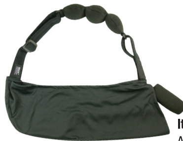
Item number: A30140 (universal)