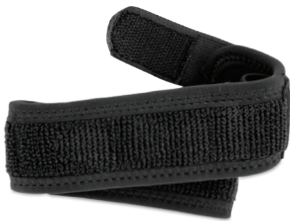
Item number: A30137 (universal)