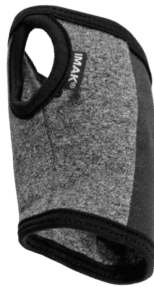
Item number: A20128 (universal)