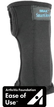
Item numbers*: A20111 (x-small) A20125 (small) A20126 (medium) A20127 (large) *Available with thumb support