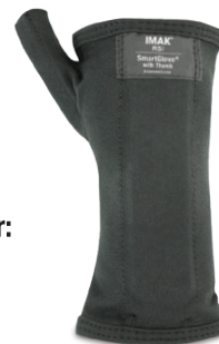
Item numbers*: A20165 (x-small) A20161 (small) A20162 (medium) A20163 (large)