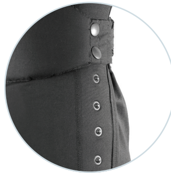
Detail of belt with snaps.