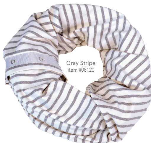
Gray Stripe item #08120