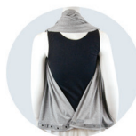
THE VEST (BACK)