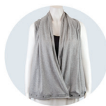
THE VEST (FRONT)