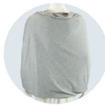
THE BACKDROP (BACK)