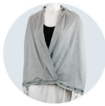
THE BACKDROP (FRONT)