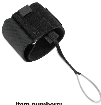
DESIGNED BY AN ORTHOPEDIC SPECIALIST