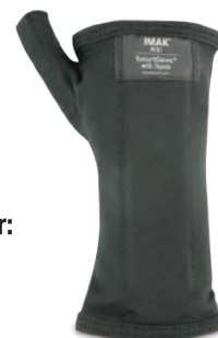
Item numbers*: A20165 (x-small) A20161 (small) A20162 (medium) A20163 (large)