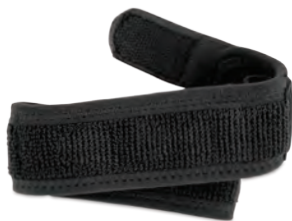
Item number: A30137 (universal)