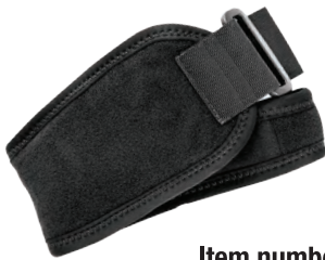
Item number: A10301 (universal)