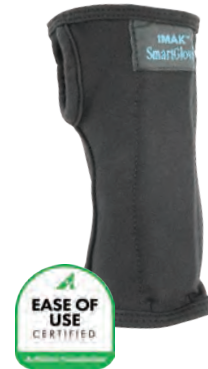
Item numbers*: A20111 (x-small) A20125 (small) A20126 (medium) A20127 (large) *Available with thumb support