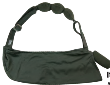
Item number: A30140 (universal)