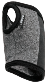
Item number: A20128 (universal)