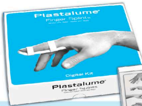
10008 Number 27 Digital Kit Fingerset Nr. 27 Kit per dita no. 27 Kit pour doigts n° 27

Fingerschienen • Stecche del ditto • Attelles pour doigts d'attelles