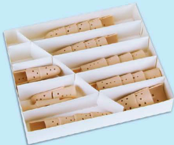
10020 Number 30 Stax-Mallet Kit (Beige) Stax-Mallet Set Nr. 30 Stax-Mallet kit no. 30 Stax-Mallet kit n°30