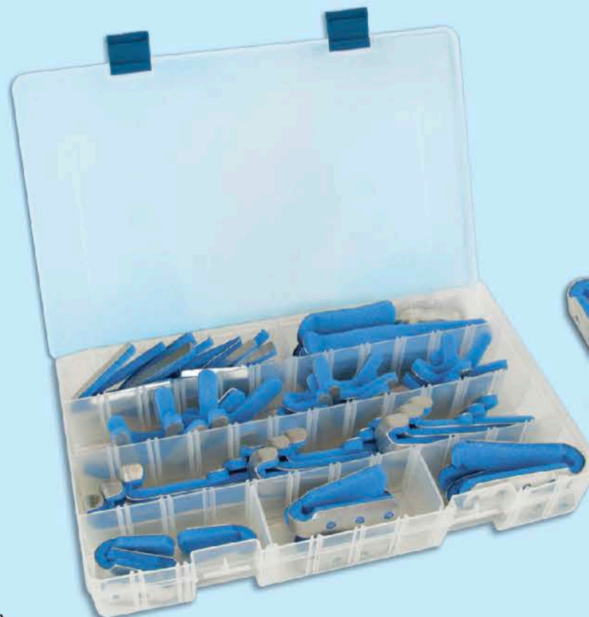
10021 Number 30 Stax-Mallet Kit (Clear) Stax-Mallet Set Nr. 30 Stax-Mallet kit no. 30 Stax-Mallet kit n°30