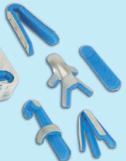
10030 Number 45 Specialty Splint Kit Schienenset special Nr. 45 Speciale stecche kit no. 45 Spéciales d'attelles kit n°45