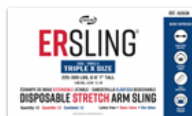
Triple XXX #J63538

Fits 90 - 250 lbs / 5' - 6' tall 41-114 kgs / 152-183 cm tall