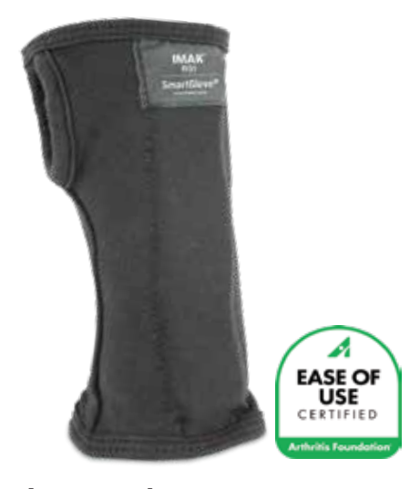
DESIGNED BY AN ORTHOPEDIC SURGEON